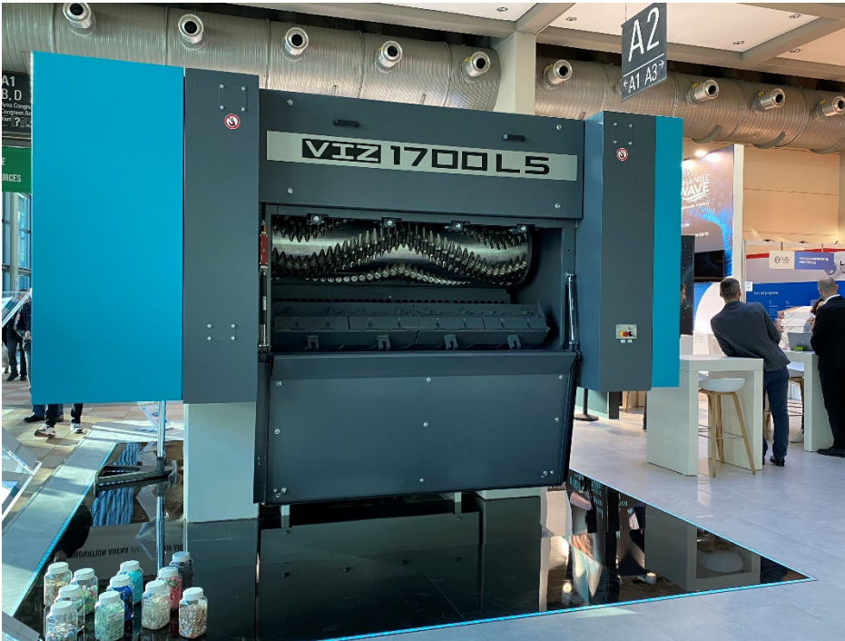
Image 1: The reliable Vecoplan VIZ shredder can be adapted to meet specific requirements.