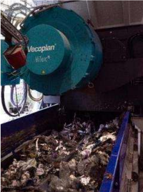
Photo 1: Shredders efficiently process packaging made from plastic, metal and composite materials. Household waste is another input material. The rotor drive is a key element.